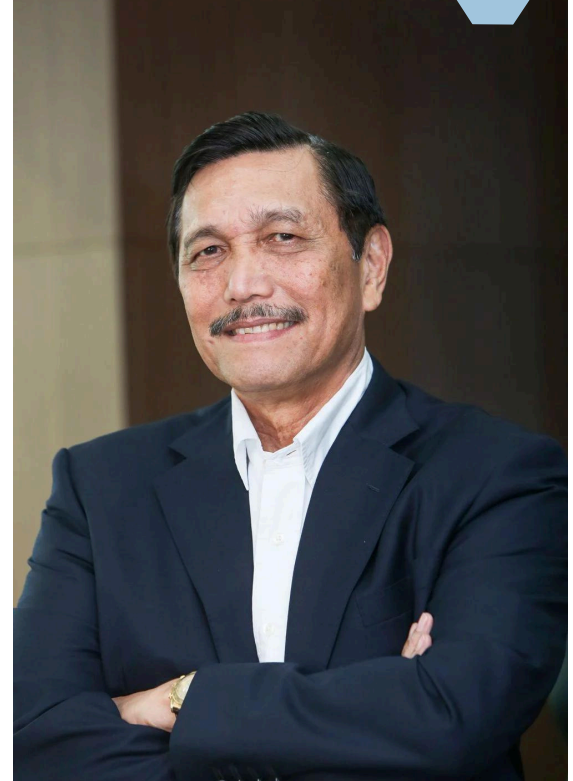
LUHUT BINSAR PANDJAITAN Coordinating Minister for Maritime Affairs and Investment Republic of Indonesia

CC.: President of The Republic of Indonesia.